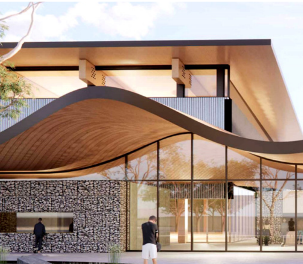
ABOVE Artist's impression of the future stadium.