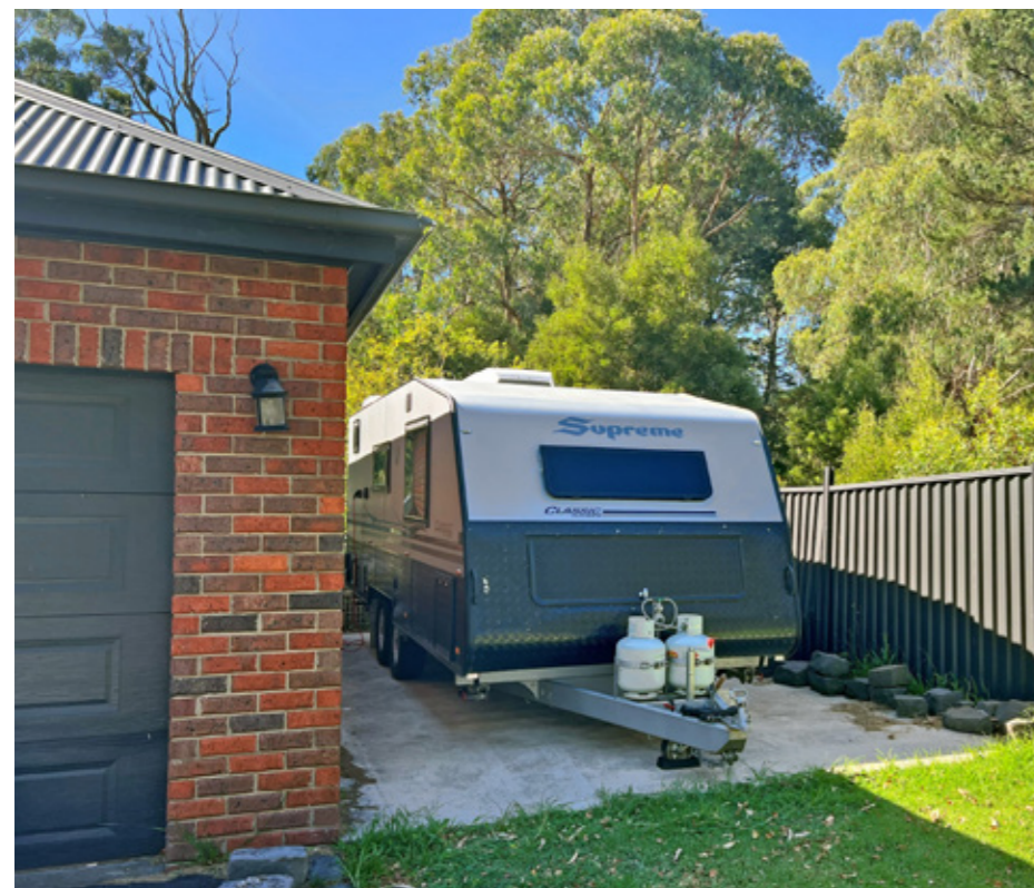
ABOVE Storing caravans safely prevents them becoming road hazards and maintains clear sightlines for safer roads and driveways.