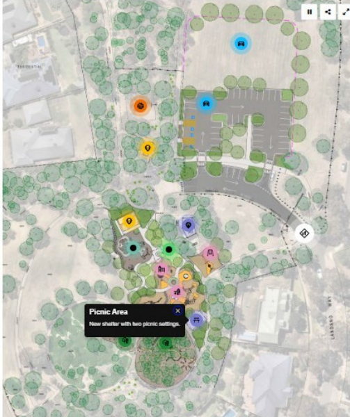
Left: interactive map from proposed Hill Top Playground & Splash Park draft concept plan on Whittlesea Engage platform