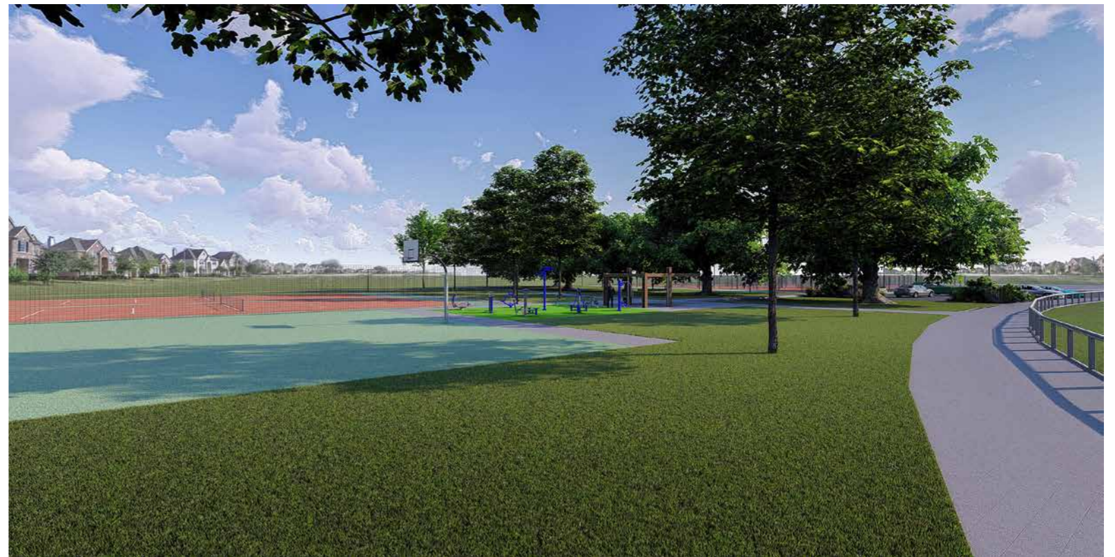
Alternate view of new dual purpose court and fitness station