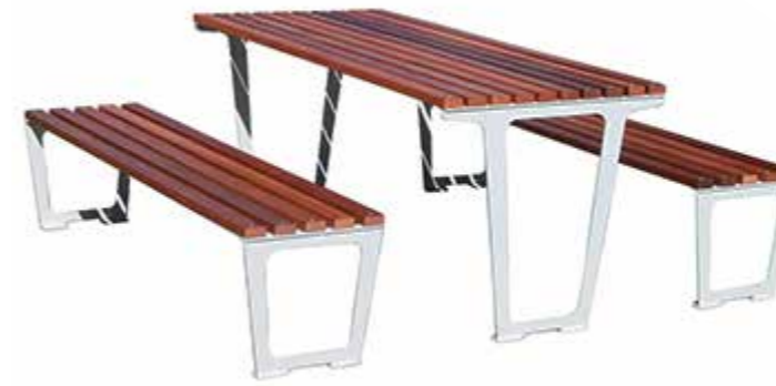
Picnic Tables (Furphy Foundry Civic Suite)