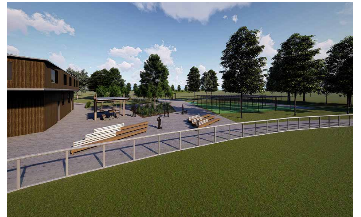
Alternate view of the new plaza area, shelter and cricket nets