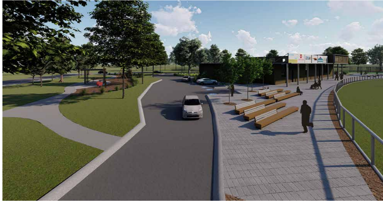
New access road, plaza and play space