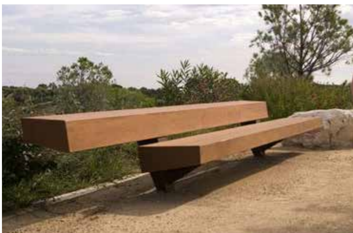
Spectator Seating Options