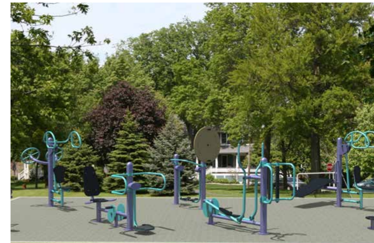
Fitness Station Example Images