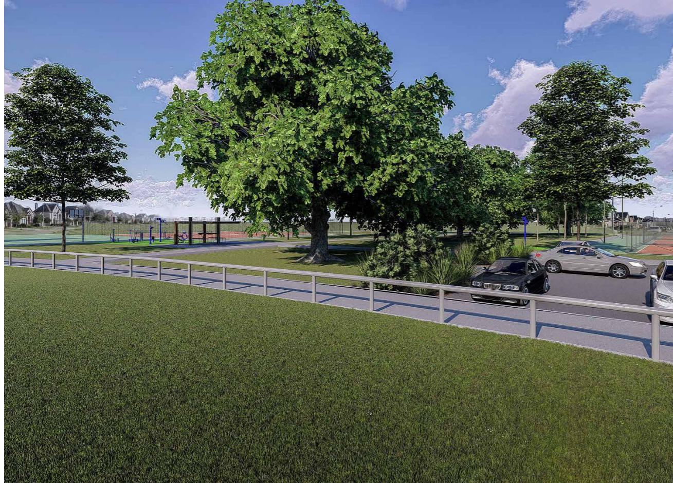
View from Oval 1 of new dual purpose court and fitness station