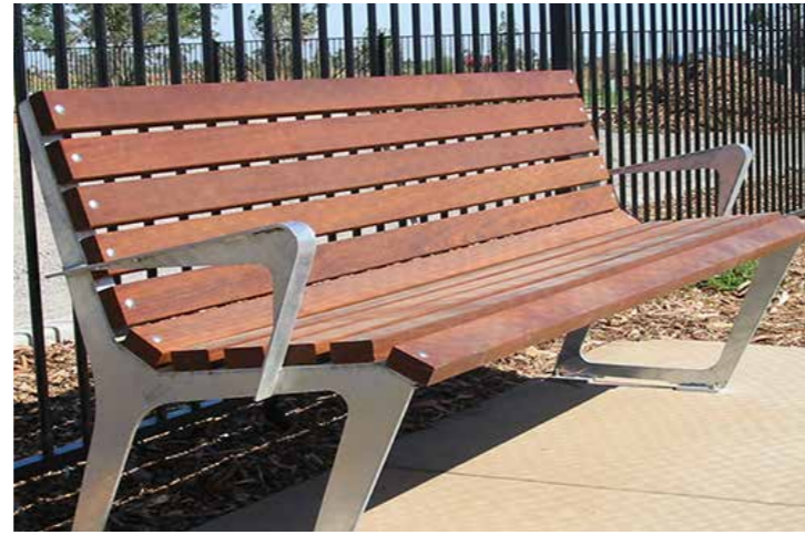
Bench Seats (Furphy Foundry Civic Suite)