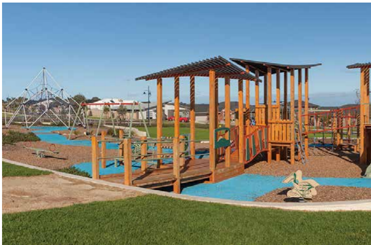
Play Area Example Images (Adventure Plus)