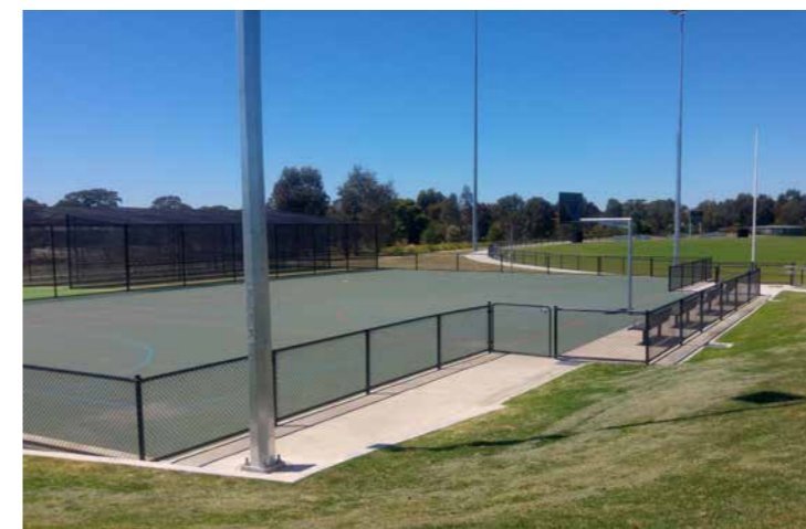
Waterview Recreation Reserve, Mernda