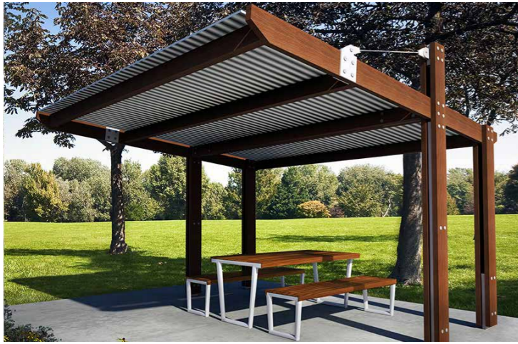
Park Shelters (Landmark Pro Longreach)