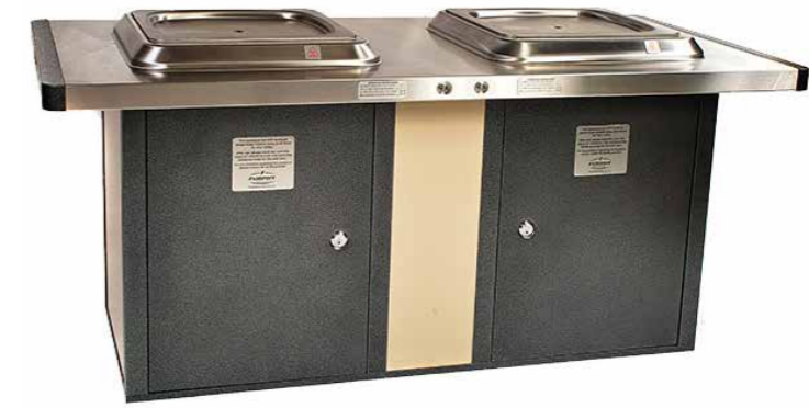
Barbeque (Furphy Foundry Evolve Double)