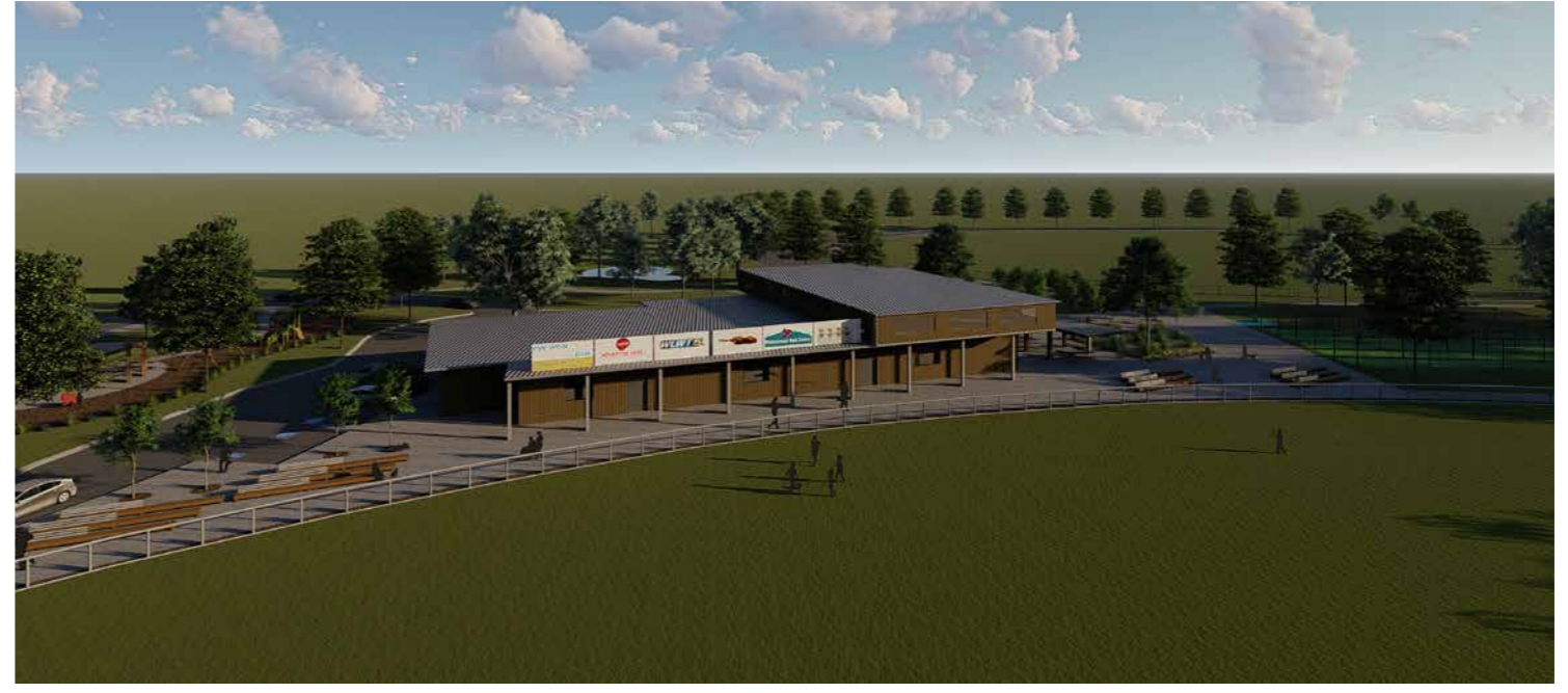
New plaza around the pavilion