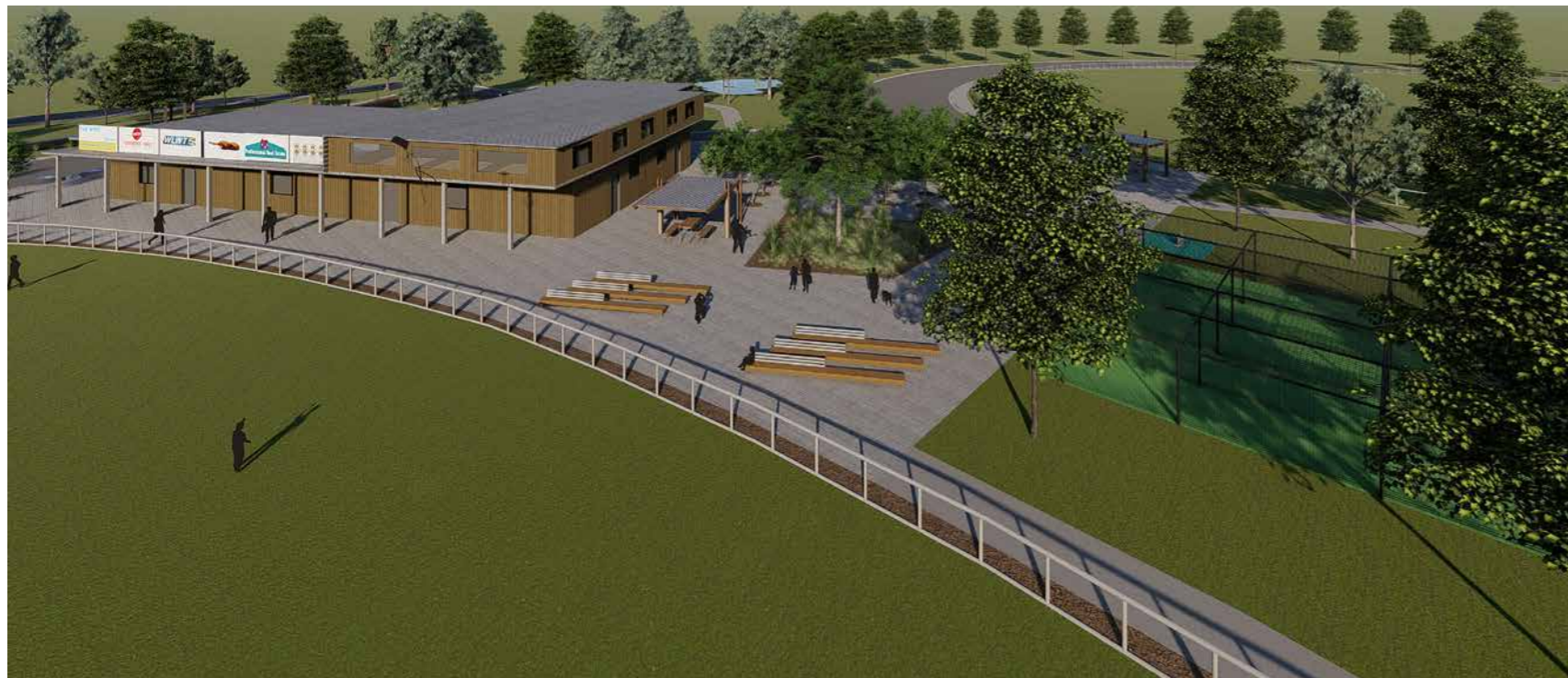
New plaza around the pavilion, shelter and cricket nets