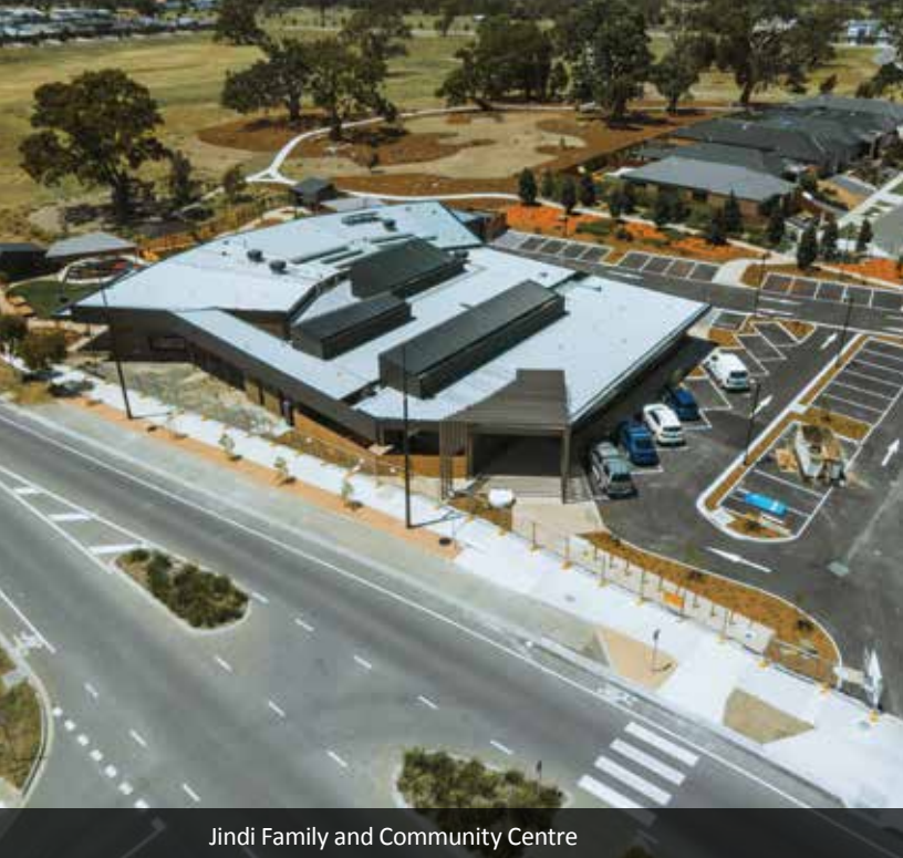
Jindi Family and Community Centre