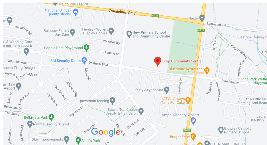
Map data ©2022 200 m

Subsidised transport for eligible community members is available. To learn more visit Community Transport - Whittlesea Community Connections .