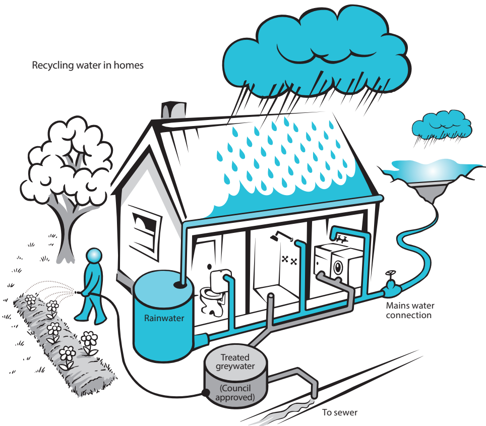
Recycling water in homes

Prior to planning a greywater treatment system, you need to obtain advice from a licensed plumber, the Department of Health and the Environment Protection Authority. A permit from Council is required.