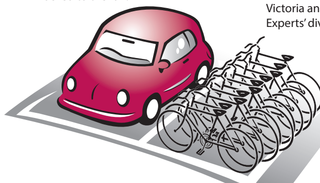
One car space can usually be converted to 10 to 14 bike parking spaces.

In recent years, the bicycle industry has developed a wide range of parking solutions addressing product selection criteria, such as space availability, user preferences and security requirements. The table below provides an overview of the most common bicycle parking systems. For further details, we recommend referring to the 'Bicycle Parking Handbook' from Bicycle Network Victoria and talking to their 'Bike Parking Experts' division